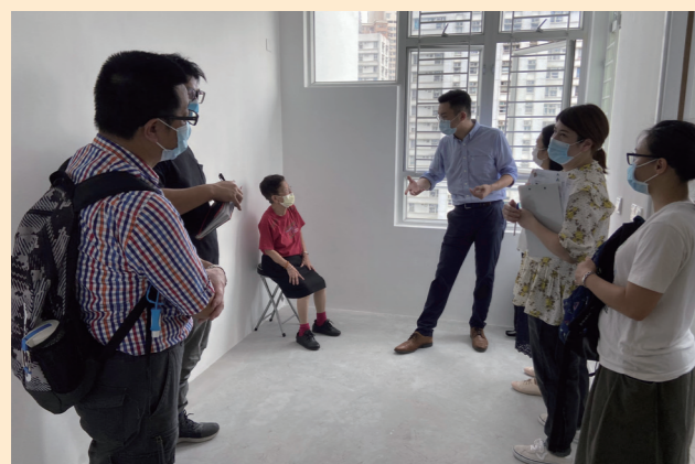
團隊與受惠者到新居視察。 The service team visits the new unit of the beneficiary.