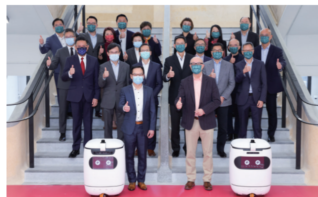
市建局及華懋團隊正共同制定中環街市的業務計劃。 The URA and Chinachem are jointly formulating the business plan of Central Market.