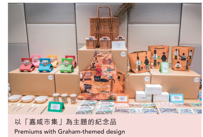
以「嘉咸市集」為主題的紀念品 Premiums with Graham-themed design

「同心網絡」總監李偉強多年來專心致志於將「文化落區」由口號實踐為付諸行動。他說由2018年開始構想今次的活動，當中遇到許多始料不及的事情，設計師們的意念也走過了多個春秋，直到今天呈現在大家眼前的禮品和口罩，都全賴設計師們對保育文化的執著才能成事。正如設計師們所言，培養文化並不是一蹴而就的事情，卻是有心人一點一滴地累積延續、傳承發展。