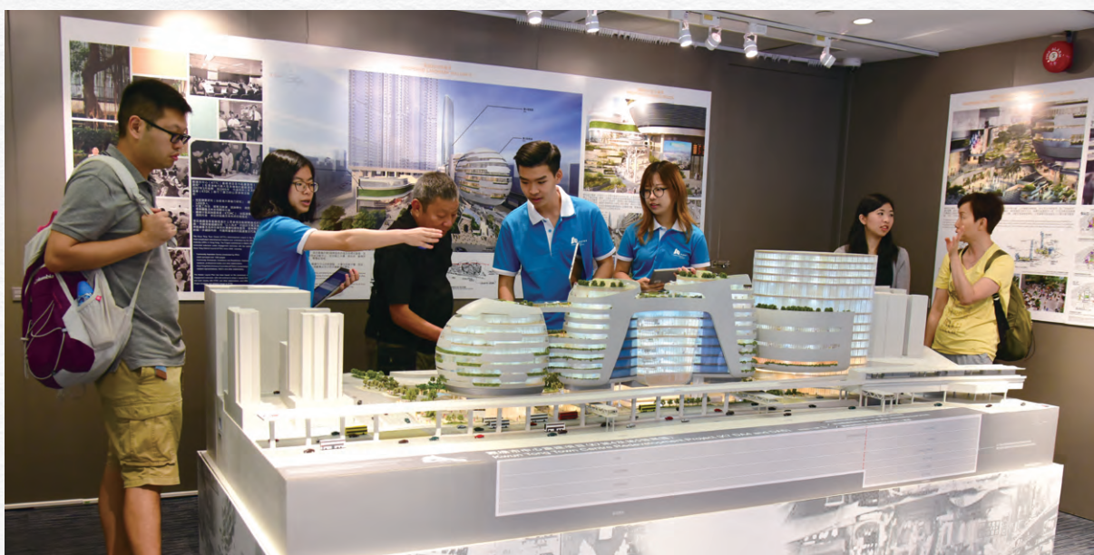
Public visit the construction model of Development Areas 4 and 5 of Kwun Tong Town Centre Project.

The URA showcased a model and information display panels to enhance public understanding of the redevelopment of the Kwun Tong Town Centre Project (K7) during a three-week period between 11 and 31 October 2018. Over 4,700 visitors and 19 local organisations, schools and Government departments visited the display venue and learned about the holistic design and proposed features of the future development of K7.