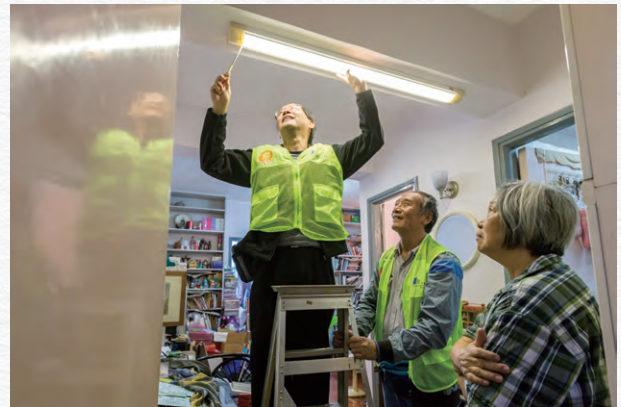
Volunteer repairmen help solitary elderly repair household appliances under the "Home Repair Services Community Programme".

As an initiative to offer assistance to families residing in poor living conditions of aged buildings, especially the elderly, the URA sponsored two local organisations to launch services titled "Home Repair Services Community Programme" in Kowloon City and Sham Shui Po. The programme included home visits to the underprivileged families and free repair of household appliances. The programme received positive responses from local residents in the two districts, and more than 400 households benefited since the launch of this community service.