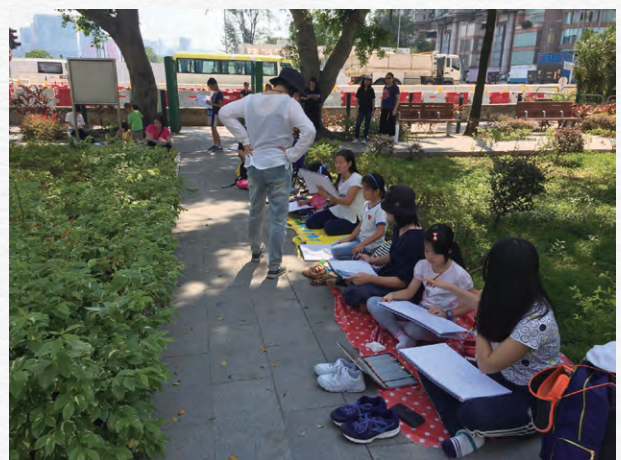
Urban sketching activity allows local residents to enjoy art while building bonds with the community.

Neighbourhood is more than its physical environment. It is the local culture and characteristics that shape its identity. An appreciation of the local arts and culture will allow for a deeper understanding of the community while enriching quality of life. In 2018/19, the URA's "Arts and Cultural Partnership Programme in Old Urban Districts: Pilot Scheme" supported a total of nine new and ongoing programmes. These covered an array of activities such as music and dance, graffiti painting and urban sketching, etc., to enliven old urban districts by bringing enjoyment to local residents. 'Hidden Art in TKW', one of the programmes with place-making element, has engaged more than 100 residents in the To Kwa Wan (TKW) district to sketch local landmarks. The art pieces were then made as art installations and exhibited in TKW for public enjoyment. Since the launch of the scheme, the URA has supported a total of 57 arts and cultural programmes, enhancing the living quality of about 667,635 people.