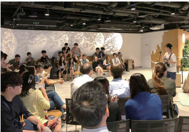
Community events held in URA premise promote health and happiness.

For better utilisation of open space for public enjoyment, place-making initiatives have been initiated in our current project portfolios (as described in the Operating Review).