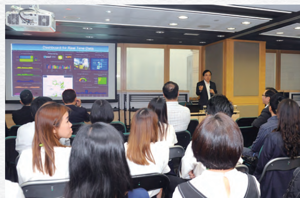
Various technical training programmes are offered to URA staff members.

Without a dedicated and competent team, the URA cannot sustain its urban renewal efforts. In 2018/19, the training focus remained on facilitating our staff members at different levels to learn the latest technologies e.g. BIM, Smart City, Artificial Intelligence (AI), Big Data, Internet of Things (IoT), etc. At the same time, effort was also put into reinforcing our staff members’ functional know-how and core competence skills in communication, stakeholder engagement, innovation, personal development and leadership. During the year, around 12,800 training hours were provided for around 4,000 participants with over 20 new training programmes, and 40 visits and talks, mostly related to innovation and technology