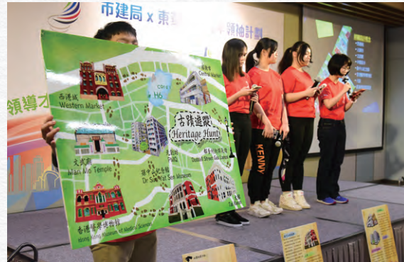
A series of education and extension programmes related to urban renewal is organised to inspire the younger generation.