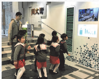
The energy flooring at “H6 CONET” aims not only for energy saving but also for interactive engagement and educational purpose.

At “H6 CONET”, a biofilter system was installed as a green wall to improve the indoor air quality. A distinctive drop of pollutants such as VOC, PM10 and CO 2 in the air flow has been realised since the installation. With the biofilter system, visitors in “H6 CONET” can enjoy clean and fresh indoor air. Meanwhile, an energy flooring, another pilot green initiative, was installed at the Tung Man Street entrance of “H6 CONET”. It is a versatile custom-built flooring system generating electricity via walk-through electro-magnetic induction of pedestrians. The renewable energy can be stored and used in real-time lighting displays for interactive engagement and educational purpose. We will further explore other suitable applications of the system in our forthcoming projects.