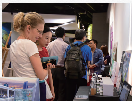
Winning piece of the Innovative Design Competition on display for public viewing.

The URA needs the concerted efforts of the society to tackle urban decay in a sustainable manner. Through collaboration and partnership programmes with various organisations, we have reached out to the community and schools to introduce the URA's work and the significance of urban renewal to youngsters and the general public.