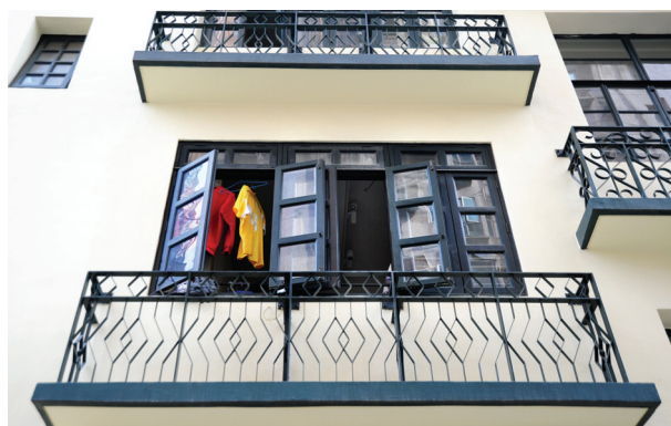
■ URA renovates acquired properties at Site A for social and community use.

The original Site A of the project comprising the Wing Lee Street area and the Bridges Street Market Site was excised from the Development Scheme Plan of the project following the Town Planning Board's decision. Properties owned by the URA at Site A were renovated and licensed to non-government organisations for social and community benefits while the URA will liaise with the Government to implement the remaining Sites B and C.