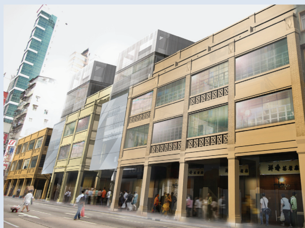
■ Artist impression of Shanghai Street preservation project.

The Shanghai Street project has now been cleared. In December 2014, the Town Planning Board approved the URA's section 16 application for the proposed project use and works. The preserved shop houses fronting Shanghai Street will be for restaurant and retail uses to reflect the local character and to meet local needs.