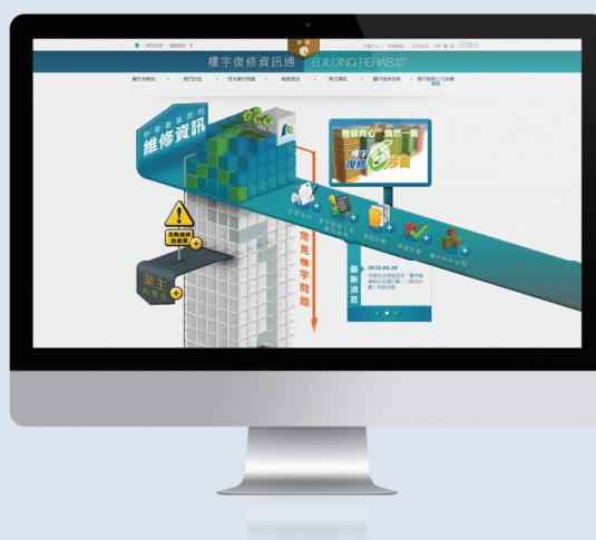
■ Building Rehab Info Net provides one-stop comprehensive information on building rehabilitation.

A building rehabilitation website (called the "Building Rehab Info Net" - www.buildingrehab.org.hk ) was soft-launched in January 2014 to serve as a one-stop e-platform for building owners to access comprehensive building rehabilitation-related information. This information includes details on and application forms for various assistance schemes, an experience-sharing corner, tender information and so on, to enhance awareness of their roles, rights and obligations as owners in rehabilitation projects. Thus far, the URA has promoted the website by informing our stakeholders and partnering government departments, district opinion leaders and other organisations. Since its launch, the website has recorded over 22,000 visits up to end March 2015. We are currently working on Phase 3 enhancement of the Building Rehab Info Net which is expected to complete in July 2015.