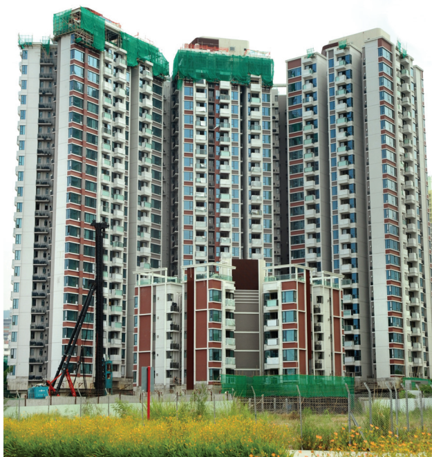
Existing view of De Novo.

In the Chief Executive's 2015 Policy Address, the URA was requested to explore ways to help increase the supply of subsidised sale flats to provide more property and home ownership choices for middle-income families. On 31 March 2015, the URA Board agreed to explore with the relevant Government Bureaux and Departments the implementation details of a mixed development scheme at De Novo.