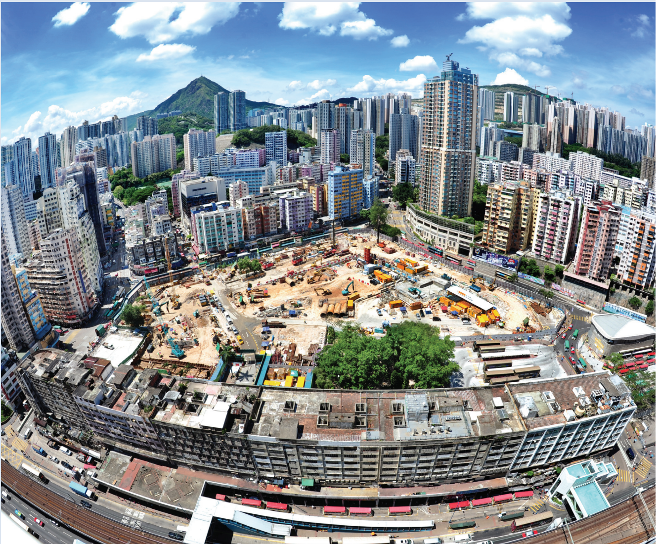
■ Panoramic overview of Kwun Tong Town Centre project site.

This complex project is being implemented in three phases, with the site divided into five Development Areas. Following clearance of Development Areas 2, 3 and 4, the tender for the residential towers and podium in Development Areas 2 and 3 was awarded in September 2014. Meanwhile the occupation permit for Development Area 1 was issued in June 2014 and the flats are almost sold out. The phased development approach has enabled the early reversion of the existing Kwun Tong Jockey Club Health Centre to Development Area 1, and the Methadone Clinic to the Hoi Yuen Road Roundabout. In addition, phasing has required the temporary reversion of existing Government offices in Development Area 4 to premises nearby, thereby vacating the site for use as interim Government, Institution and Community facilities to reversion the hawker bazaars, Public Light Bus termini, refuse collection point and public toilet from Development Areas 2 and 3. An interim bus terminus has also been provided on the former Mido Mansion site in Development Area 4. These facilities are all now in use.