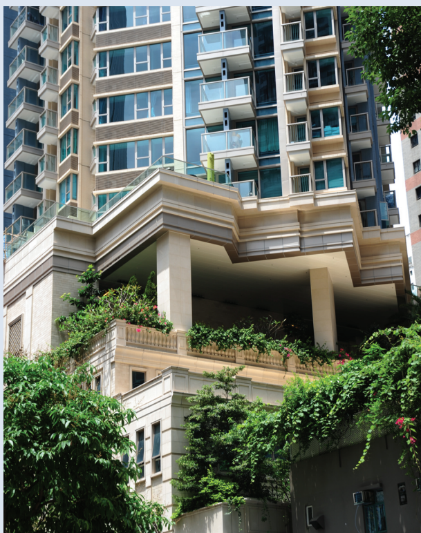
■ The construction of Lee Tung Street / McGregor Street project is nearing completion.