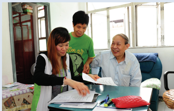
■ URA staff conducts freezing survey.

This is a single nine-storey building erected in 1963 occupying a project site area of 865 square metres and populated by some 156 households. The project is expected to produce 138 flats and 243 square metres of commercial space.