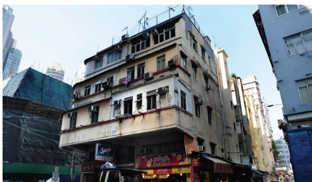
■ Existing view of the project.

This project is located on the opposite side of the URA's Ma Tau Wai Road/Chun Tin Street project which is in the early stages of construction. The project comprises seven buildings of between four and six storeys built in the mid-1950s and occupying a site of around 1,226 square metres. The site has the potential to develop 150 flats and 1,338 square metres of commercial space.