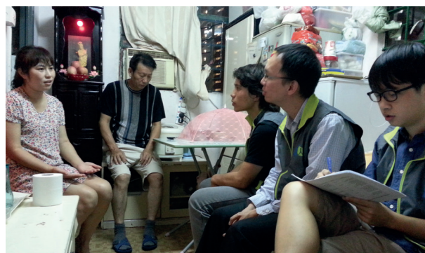
Visiting the “Energy Poverty” households.