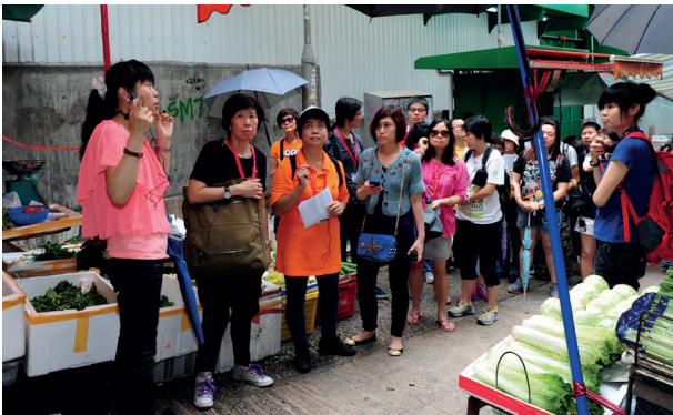
Docent tours in old districts help promote experiential learning.