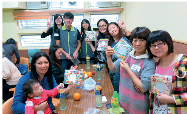
Caring for the Single-parent families.