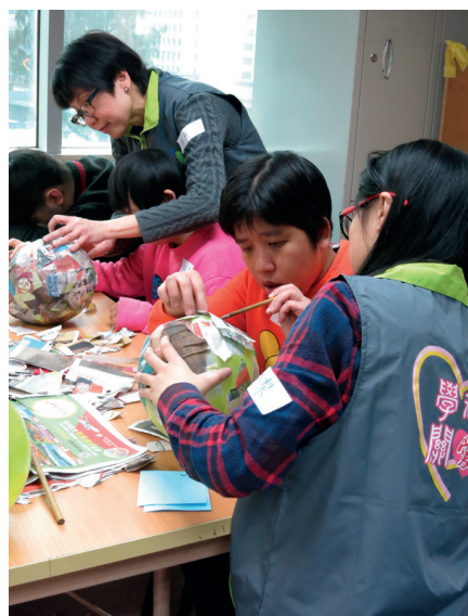
Caring for the Mentally-Challenged people.