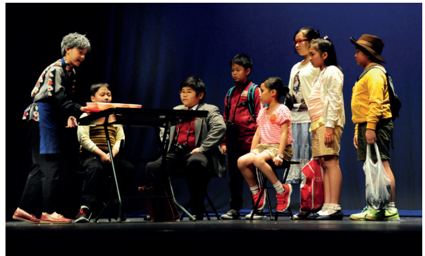
Primary school kids thrill the audience in a drama performance on urban renewal.

“Our school is in Sham Shui Po and many of our students used to live or are now living in old buildings. In the past two years, our students have participated in various educational activities of the URA. These help them consolidate their learning and learn to be empathetic and understanding of others, which are beneficial to their development. I appreciate that the URA as a public body strives to promote the public understanding of urban decay problem and care for the community, making the development of urban renewal sustainable.”