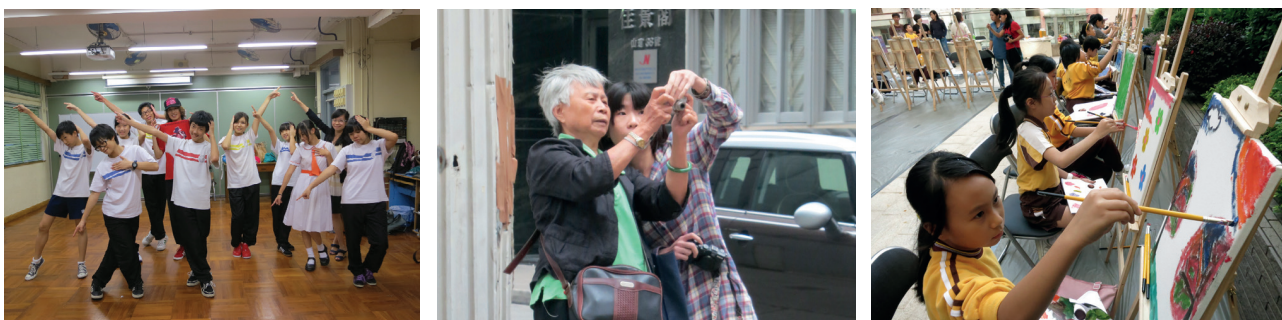
The URA supports arts and cultural programmes for the benefits of the local community in old districts.