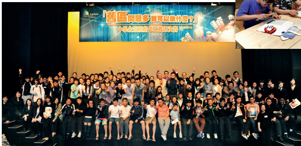
Group photo of the competing teams at the finale of Secondary School Drama Competition.