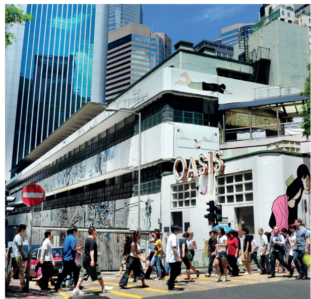
Existing view of Central Oasis.

The URA has continued to steer the international design consultancy to prepare the conceptual design for Central Oasis. Major character defining elements including the facade, the atrium, the structural grid and the main staircases of the market building are being preserved. Major modifications of the building include the addition of an ‘Urban Floating Oasis’ on top of the existing building and a new basement. A section 16 planning application for minor height relaxation was approved by the Town Planning Board (TPB) in July 2013. In late 2013, an application for judicial review was filed against the TPB’s decision. The Court refused to grant leave for the judicial review in April 2014. Based on the approved section 16 notional scheme, the URA’s consultant has prepared the General Building Plan (GBP) which is now pending approval by the Building Authority. The URA is also working with