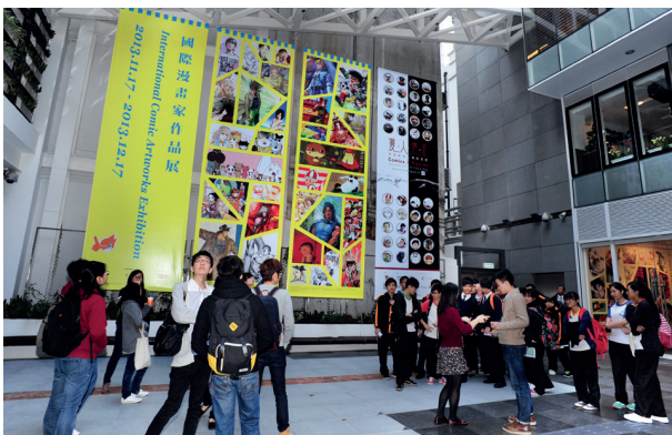
Comix Home Base has become popular among comic fans, local and overseas alike.

The Hong Kong Arts Centre is now operating the “Comix Home Base” at the Mallory Street/Burrows Street revitalisation project which provides a platform for local and international art exchange. Since the completion of the project and its official opening in July 2013, the “Comix Home Base” has become a very popular attraction with the number of visitors approaching 250,000 by the end of March 2014. The URA has retained ownership of the project and will continue to oversee its operation. In the past year, the project has received awards from different professional institutes commending the innovation, heritage conservation, adaptive reuse, design and revitalisation benefits of the project.