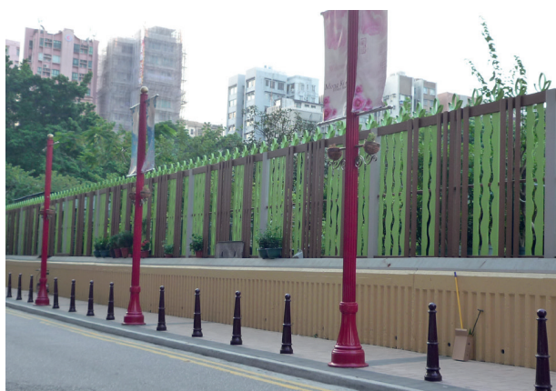
Streetscape improvement works in Mong Kok.

The URA is enhancing the local characteristics of five themed streets, namely Flower Market Road, Tung Choi Street, Sai Yee Street, Fa Yuen Street and Nelson Street involving streetscape improvement to enhance their unique characteristics and ambience. The improvement works at Flower Market Road have been completed whereas the improvement works at Tung Choi Street still requires the completion of gazettal procedures.