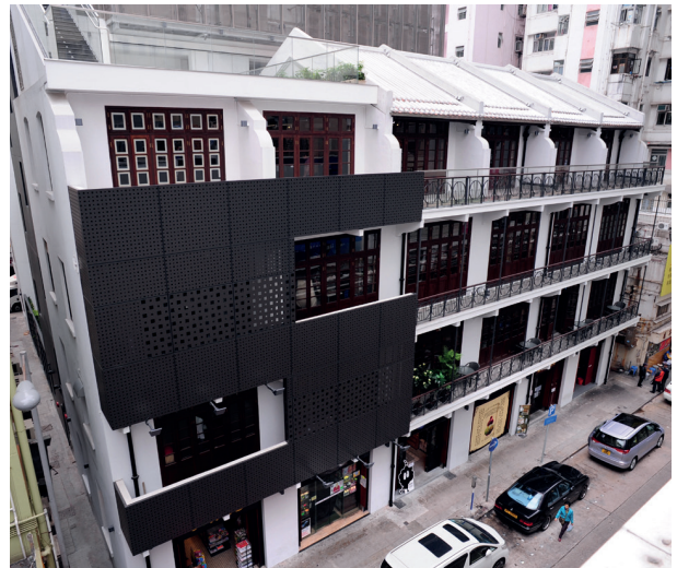
The Mallory Street/Burrows Street project and its awards: