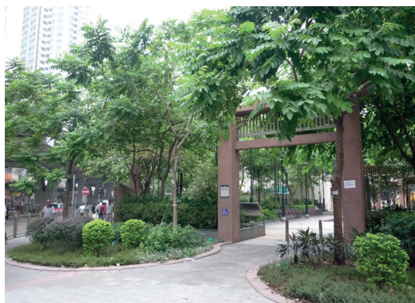
Street beautification works in Tai Kok Tsui.

Following the completion of the Phase 1 and Phase 2 improvement works along Beech Street and the Cherry Street roundabout, the Phase 3 streetscape improvement works which covers several streets in Tai Kok Tsui is progressing well. Works for package 1 of the Phase 3 works which involves improvement and greening of parts of Fuk Tsun Street and Tai Kok Tsui Road is now complete. The works contract for implementation of package 2 of Phase 3, which includes parts of Fuk Tsun Street, Fir Street and Larch Street, was awarded in February of 2014 and is scheduled to complete around the end of 2015.