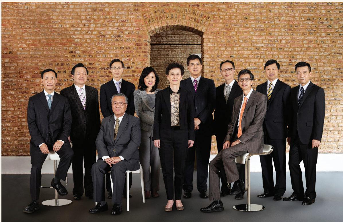
Photo taken at the Mallory Street/Burrows Street Revitalisation Project in July 2013