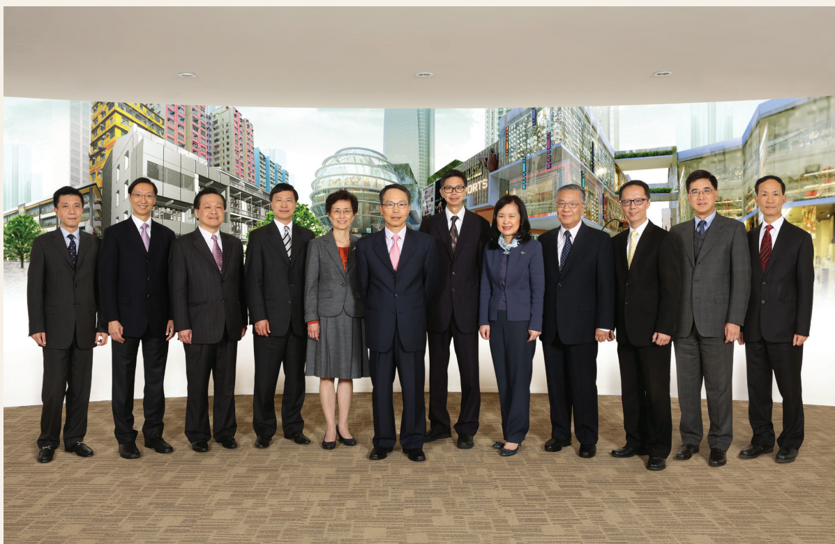
Photo taken at Urban Renewal Exploration Centre in February 2013