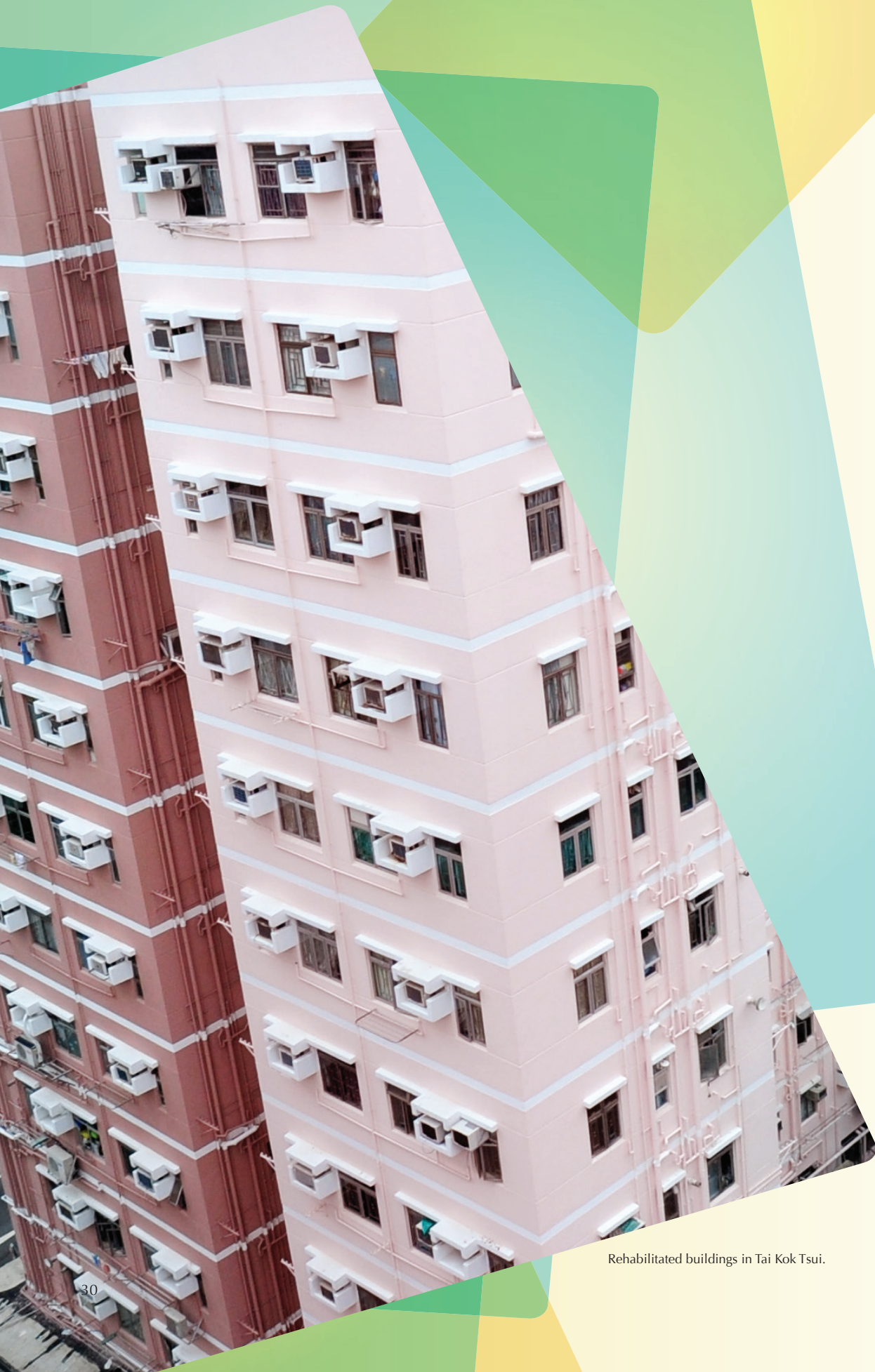
Rehabilitated buildings in Tai Kok Tsui.