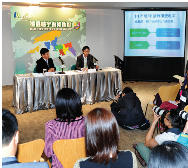
Press conference on the new arrangements of URA's building rehabilitation service areas.

units) have been rehabilitated under the MIS and 230 buildings (19,160 units) under the LS. Currently, there are a total of 187 IBMAS cases in progress, including 97 CAS and 6 CAL cases. The financial assistance, technical advice and coordination services provided by the URA to Owner's Corporations are welcomed judging by the enthusiastic response.