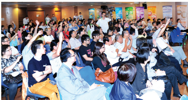
The seminar on Integrated Building Maintenance Assistance Scheme is well received by the owners.

The URA has given full support to the Government's OBB programme since it began in 2009. At the end of 2012/13, 830 buildings (around 31,600 units) out of the 1,450 target buildings within the URA's Rehabilitation Scheme Areas (RSAs) had either been rehabilitated or rehabilitation works were nearly complete. Through conscientious efforts and collaboration with the ICAC and the HKHS, guidelines and procedures have also been published and implemented to tighten requirements on service providers in the building renovation industry aimed at mitigating malpractices and promoting public education.