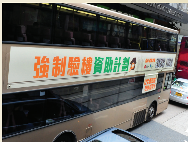
Advertisement on bus to promote the Mandatory Building Inspection Subsidy Scheme.

with URA providing a one-stop continual building care service.