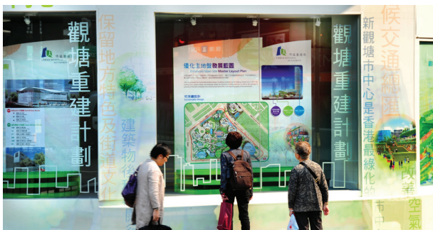
A Yue Man Square Display Gallery has been set up for the Kwun Tong Town Centre Redevelopment project.

financial position, the URA could not have commenced this project which is planned for completion in 13 years and which involves phased development and the resolution of many complex logistic issues. From a holistic planning perspective, mega developments do provide greater latitude in providing quality open space, more diverse land use mix and community facilities, as well as transport infrastructure. However, one has to recognise that the changes they bring about to a neighbourhood are also more substantial. Disruption to the social fabric, and loss of vibrancy in the district concerned for extended periods are real concerns. So too is the pressure being put on local private and public housing supply during the redevelopment period with large number of affected owners and tenants clamouring for replacement accommodation. Taking on too many mega urban renewal projects frequently or more than one such project in a district has to be carefully considered.