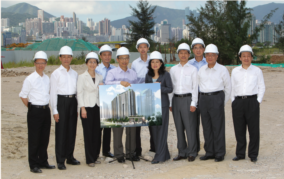
Photo taken at Kai Tak development site for flat-for-flat.