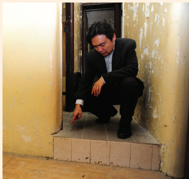
Inspection of building condition by URA staff.

The URA will progressively take over the rehabilitation work from the HKHS by assuming these responsibilities in Kowloon in 2013, and then the whole territory by 2015. This expansion will take URA's rehabilitation work beyond its existing RSAs and to this end, the