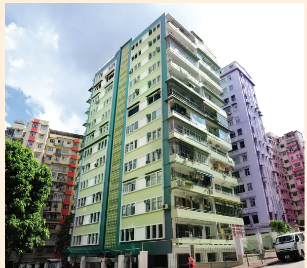
The new look of Wa Fung Mansion in Kwun Tong after rehabilitation.

Since 2004, the URA has been assisting owners in rehabilitating their buildings under its Materials Incentive Scheme and Loan Scheme, with a total of about 550 buildings or 44,000 units assisted up to the end of March 2011. From 1 April 2011, these schemes, together with those operated by the Hong Kong Housing