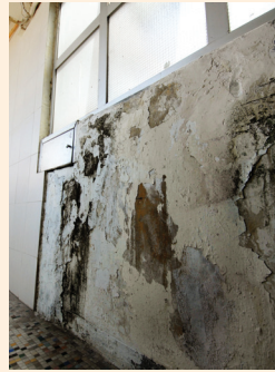
Tsui Yuen Mansion in Yau Ma Tei before and after rehabilitation.