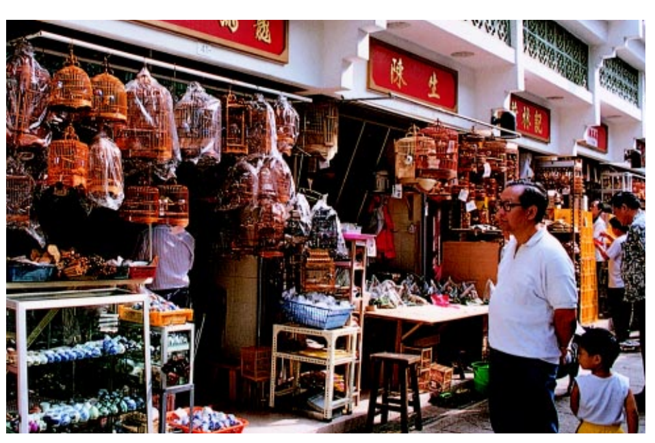
由康樂街「喬遷 |往旺角園圃街的雀鳥花園。 The Bird Garden at Yuen Po Street, Mong Kok, is 'relocated' from the Hong Lok Street.

The URA's work is guided by the Government's Urban Renewal Strategy,