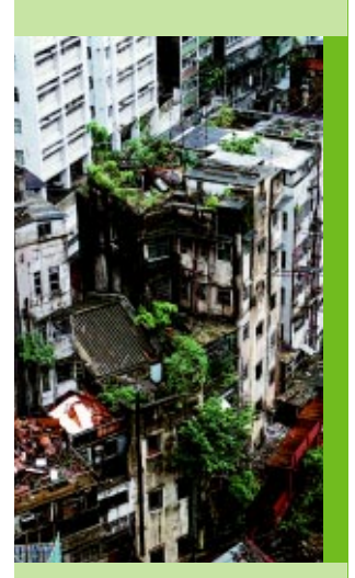
Redevelopment project in Queen Street, Sheung Wan.

Redevelopment was the primary focus of the LDC. This alone is not sufficient in the realisation of the URA's vision. We have set ourselves new priorities in the framework of our mission statement: redevelopment, rehabilitation, preservation, and revitalisation, otherwise known as the '4Rs'.