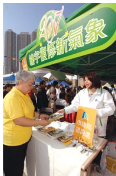
市建局職員向市民介紹樓宇復修計劃詳情。 URA staff explains the building rehabilitation scheme.