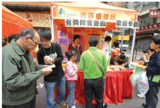
市建局於上環行人假日坊擺設攤位，向市民宣傳樓宇復修的好處。 URA sets up booth at Sheung Wan Promenade to promote benefits of building rehabilitation.

經過一番的努力，本局的樓宇復修服務區開始出現了多組群令人耳目一新的樓宇。除了為業主立案法團提供技術支援外，本局於二零零六年/零七年度向超過二十幢樓宇提供了外牆顏色組合設計，令這些樓宇完成復修工程後，更能顯出其獨特風格。類似的服務亦擴展至附近的其他三組樓群，協調的外牆顏色設計，令整個地區的面貌得以提升。