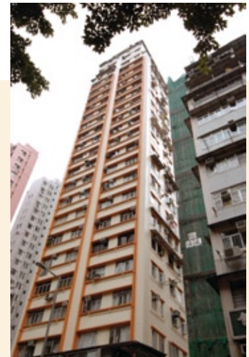
最佳復修樓宇（第1組別—50個單位以下樓宇）：灣仔東昇樓。 Best Comprehensive Rehabilitated Building (Category 1 — Buildings with under 50 units): Tung Sing Building, Wan Chai.