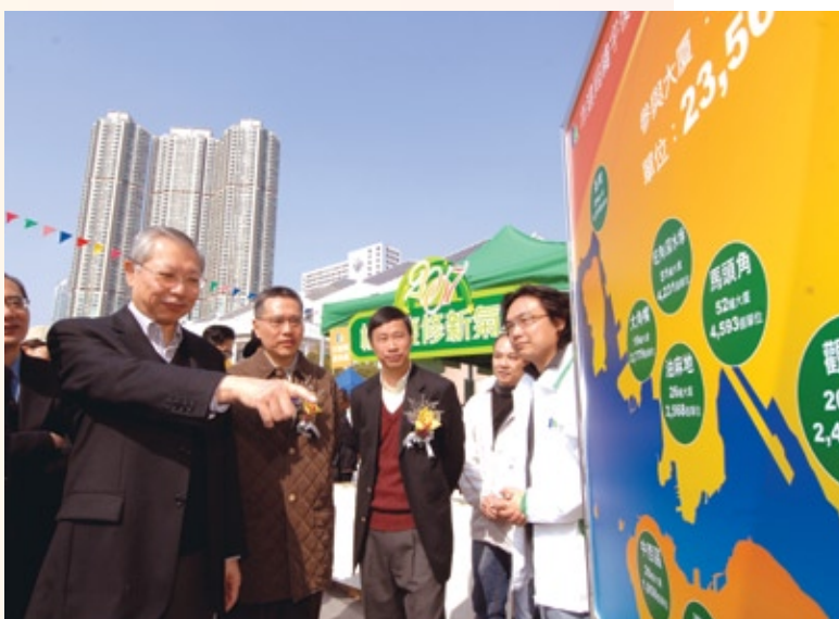
市建局向房屋及規劃地政局局長孫明揚先生簡介樓宇復修的工作。 The Secretary for Housing, Planning and Lands, Mr Michael Suen is briefed about URA's rehabilitation work.