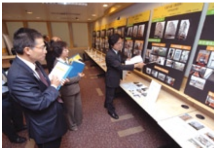
評審團進行最佳復修樓宇的評選。 Judging panel of the Best Rehabilitated Buildings.

organized by Government Departments and public bodies. We have also publicized the benefits of building rehabilitation and common issues related to it through seminars, submitting articles to professional journals, media interviews and presentations to academics and professional groups from both local institutions and overseas.