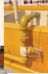
最佳復修樓宇（第2組別—50個單位以上樓宇）：大角嘴大公樓。 Best Comprehensive Rehabilitated Building (Category 2 — Buildings with over 50 units): Ta Kung Building, Tai Kok Tsui.