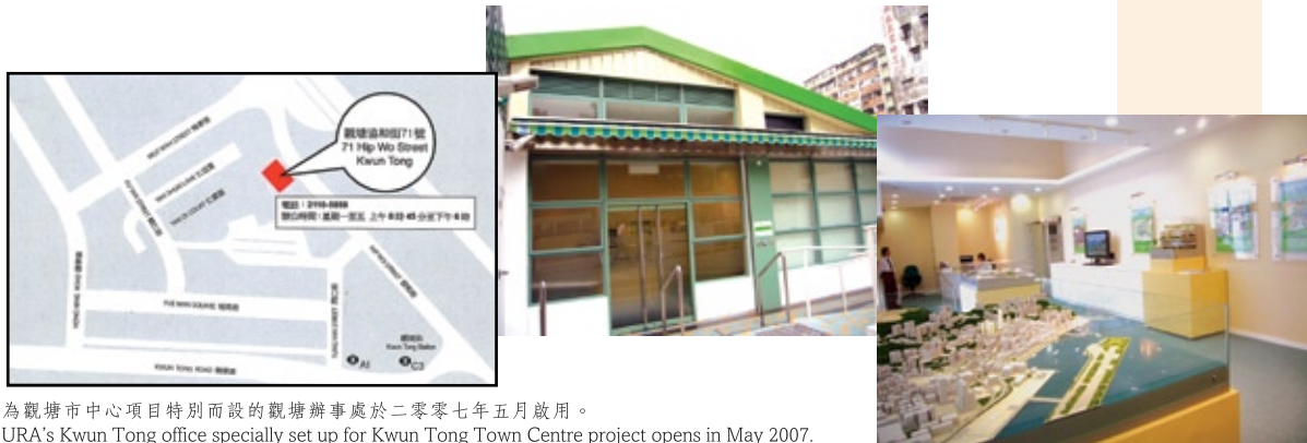
為觀塘市中心項目特別而設的觀塘辦事處於二零零七年五月啟用。 URA's Kwun Tong office specially set up for Kwun Tong Town Centre project opens in May 2007.

In early 2007, the URA established a dedicated social service team to serve those affected by this project and in need of help. Then, in May 2007, we opened our Kwun Tong Office, located in the heart of the project site, to facilitate ongoing close liaison with all stakeholders.