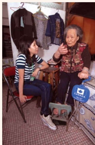
觀塘社區服務隊接觸居民，了解他們的需要。 The social service team visits a resident in Kwun Tong Town Centre project to understand her needs.