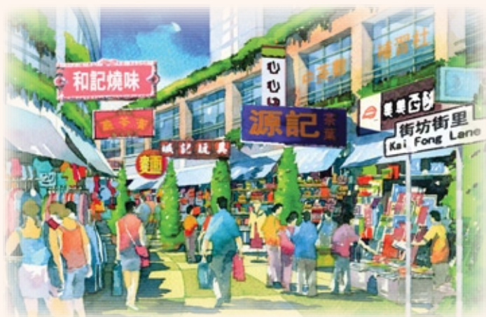
從物華街進入平民化的「街坊街里」內，車仔麵和叉鵝飯等一應俱全。 Access from Mut Wah Street, a specially designed “Kai Fong Lane” with traditional shops offering barbecue meat, “won ton” noodles and bargain shopping.