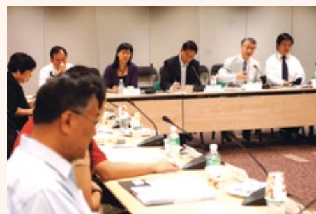
觀塘分區諮詢委員會討論觀塘市中心項目進度。 Kwun Tong District Advisory Committee discusses the progress of Kwun Tong Town Centre project.

此外，本局接手前土發十個已開展的項目，其中兩個已完成，其餘八個仍在進行中。有關本局現時全部三十一個重建項目的詳細資料，包括二十三個本局開展的項目，以及八個從前土發接手進行中的項目，均載於第六十六頁的重建概覽一章。