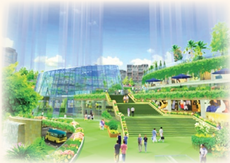
位於項目中心的交通總匯的中庭，採用平頂錐型透明設計，是觀塘市中心的一大設計特色。 The Public Transport Interchange atrium (in the centre of the redevelopment) - a glass cone with a truncated top - makes it another design feature in the Kwun Tong Town Centre redevelopment.

本局聘請的建築顧問公司糅合了工作坊的六個概念設計，設計出三個詳細的專業設計方案，並於二零零六年八月至十月進行路演及外展諮詢，收集公眾的意見，展覽期間共吸引逾八萬五千四百人參觀。有關的公眾諮詢報告亦於二零零六年十一月完成及公布。經過招標程序，本局其後委託一間建築顧問公司，在小心考慮過公眾的意見及訴求後，製備了一份包涵技術性評估的總綱發展示意圖。本局於二零零七年四月將項目內兩個地盤的發展計劃圖則，連同技術研究報告及第一期社會影響評估，提交城規會考慮。發展計劃圖則融合了社區的主流意見及以下十二項設計特色：