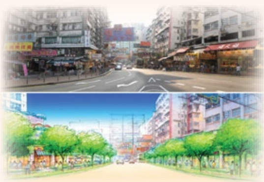
整體建築後移，令物華街擴闊33呎，再加以綠化。 Mut Wah Street will see a facelift with a 33-foot setback of building lines and widening and street-side planting.

In accordance with these principles, roadshows and “door-stepping exercises” were then conducted from August to October 2006, welcoming the views of the public on three design concepts prepared by architectural consultants. Over 85,400 people visited our roadshow venues during this period, and their views were collected and compiled in a survey report that was issued in November 2006. An architectural consultant was then appointed to prepare a notional Master Layout Plan giving due regard to the community’s requirements and aspirations. As a result, 12 major design features were included in the two DSPs for the two sites comprising this project which were submitted to the Town Planning Board for consideration in April 2007. These features were: