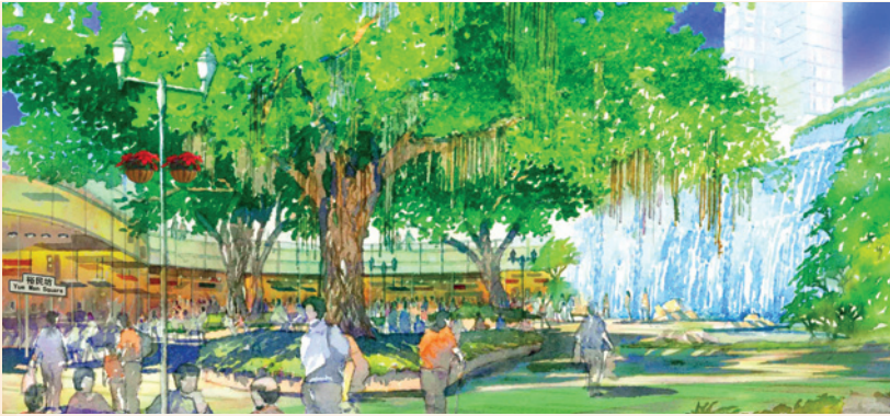
Kwun Tong Town Centre project : preserved old trees and new water feature at Yue Man Square.

When planning a redevelopment project, we constantly challenge ourselves on the question of its eventual benefits to local residents. Our aim has to go beyond just helping those living in abject squalor to move to better living conditions. Wherever we can, we strive to revitalise public spaces for the widest possible range of public activities and enjoyment. We also make sure we enhance government, communal and institutional facilities, improve hygiene and sanitation, and provide safer public environments.