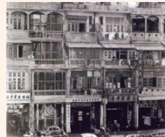
Examples of rare pre-war shophouses in Hong Kong.

The Chief Executive's Policy Address of October last year entrusted the URA with new responsibilities for conservation. As a result, we have expanded our conservation strategy to cover 48 pre-war shophouses, a project that will be a major contribution to the preservation of important features of our architectural past which are particularly valued by the community. This is now perhaps the most ambitious initiative of the URA in terms of safeguarding significant heritage elements of our city.