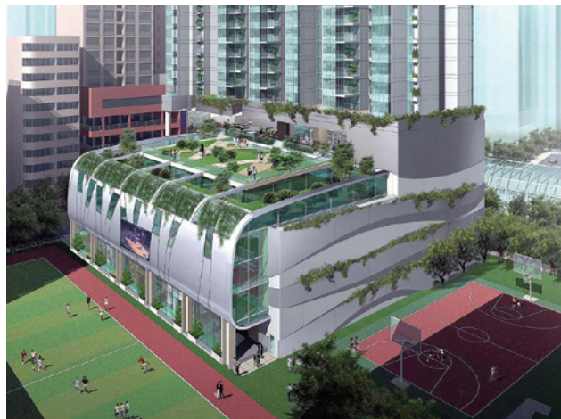
The Macpherson Indoor Stadium project delivers modern stadium facilities and a youth centre.

In April 2006, the URA and the Hong Kong Playground Association (HKPA) announced that they would jointly redevelop the HKPA's outdated stadium to provide both a modern stadium and a youth centre as well as residential and retail space. Since then, good progress has been made. Following detailed negotiations with the Buildings and Lands Departments respectively, the revised General Building Plans were approved in March 2008 and the land premium offer was agreed in May 2008. In the same month, the HKPA and URA invited tenders for the joint venture development of the project and in June 2008, they awarded the joint venture development contract. Looking ahead and given the proximity of this project to the URA's project in Sai Yee Street in the "Sneaker Street" neighbourhood, URA intends to link up these two areas by revitalising the streets between them. The opportunity will also be provided for sports shop operators affected by the Sai Yee Street project to relocate to the retail space in this project to maintain the continuity of their business as in this neighbourhood during redevelopment of the Sai Yee Street project.