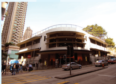
The Wan Chai Market Building (present)

Under the revised MLP, the core elements of the market building, including the major façade, the main entrance, the curved canopy and fins, and part of the front portion of the structural form, will be preserved in-situ. This provides a pragmatic solution whereby the URA can honour its contractual agreement with the developer whilst at the same time recognizing the current community's wish for preservation of the market to the extent practicable, albeit at an additional estimated cost of over $200 million to the URA and with a longer development period.