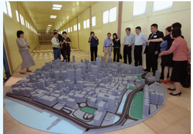
Members of the Kwun Tong District Council observe the wind-tunnel test of the Kwun Tong Town Centre model conducted by the Hong Kong University of Science & Technology.

owners, so that they can use it for making property rental and acquisition enquiries, seeking help from social service teams, checking and validating documentation prior to signing sales contracts, meetings with URA staff and so on.