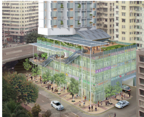
Chi Kiang Street/Ha Heung Road project uses building set-back design to facilitate pedestrian flow.

This is one of two new URAO projects commenced by the URA in Ma Tau Kok on 29 February 2008. This modest sized project, of around 930 square metres, comprises buildings built in the 1950's and now in generally poor and dilapidated physical condition. When implementing this project, the URA intends to take the opportunity to make street improvements to the area beneath the adjacent Kowloon City flyover. No written objections were received during the two months publication period and the decision of the Secretary for Development to authorise the URA to proceed with the project was gazetted on 18 July 2008.