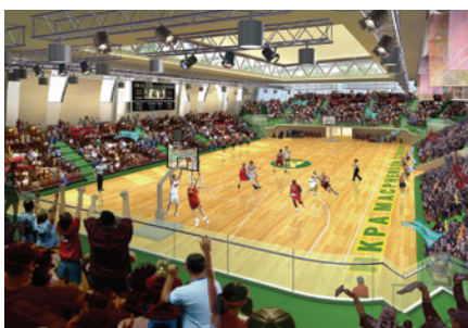
A modern indoor stadium will be provided in the redevelopment project.