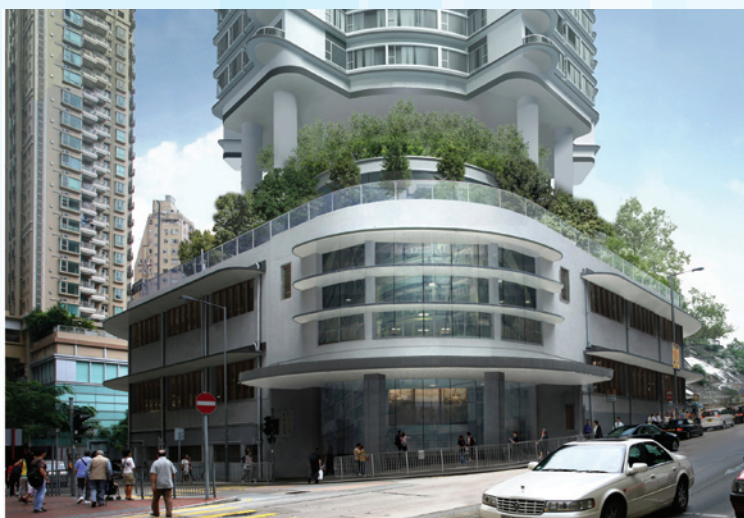
Core elements of the Wan Chai Market building will be preserved in-situ.