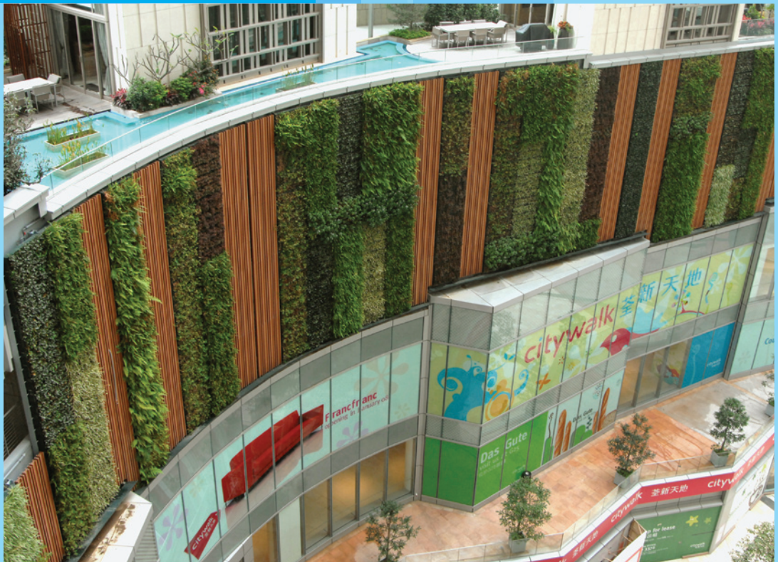
The Tsuen Wan Town Centre project features vertical greening of about 8,000 square feet.