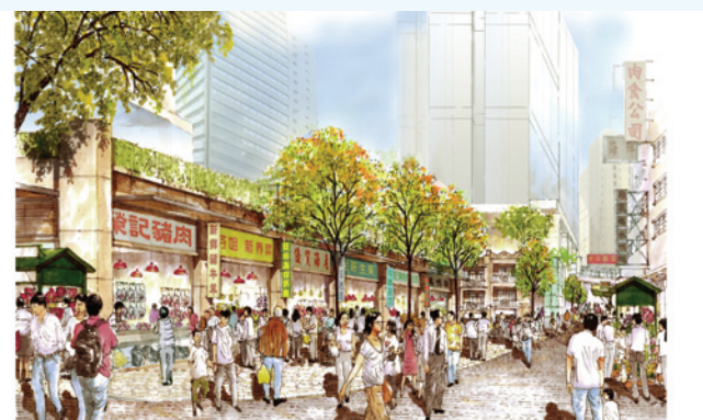
Artist's impressions of the two-storey block for accommodating wet market shops. Viewing from Graham Street (above) and Gage Street (below).