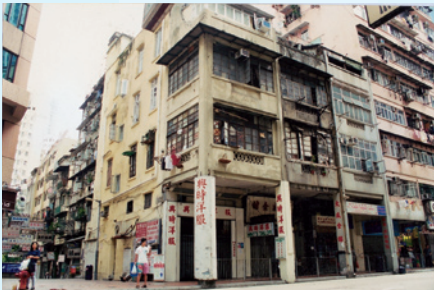
Three Cantonese verandah shophouses will be conserved for adaptive re-use.

In May 2007, the MLP was approved by the TPB. Subsequently, in December 2007, the URA unveiled our plans to create a “Wedding City” featuring Hong Kong’s first wedding traditions and culture gallery, and a retail area catering for wedding related trades such as wedding dresses, flowers, decorations, cakes, hair salons, jewellery, photo studios and wedding organizers. In addition, there will be a pilot social enterprise scheme under which social enterprise operators with good local knowledge and connections will be invited to operate a centre aimed at preserving and strengthening local social networks. During the year, demolition was also completed. In April 2008, the road proposals, including closure of Lee Tung Street, was gazetted. In due course, expressions of interest in joint venture development of the site will be invited.