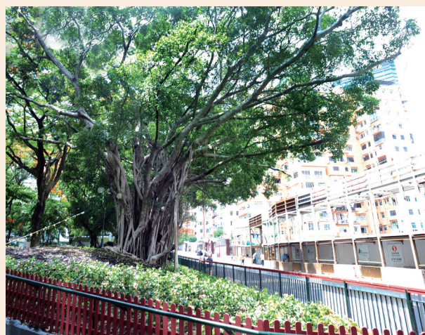
The tree at the Yuet Wah Street Playground.