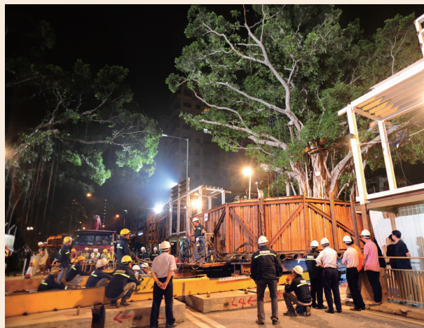
Working around the clock to move the tree to its new home nearby.