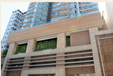
Bedford Road / Larch Street project