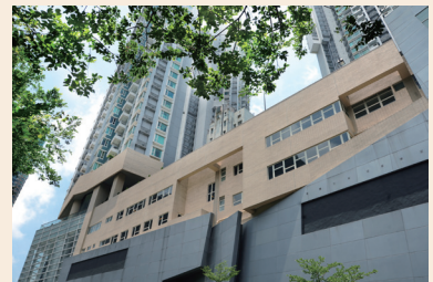
Cherry Street project