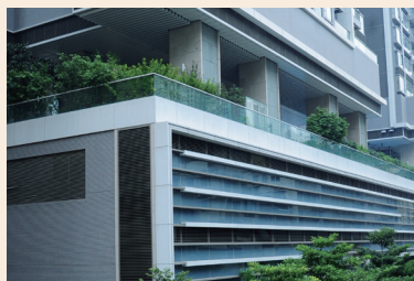
First Street / Second Street project