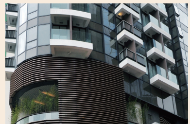
Queen's Road East project