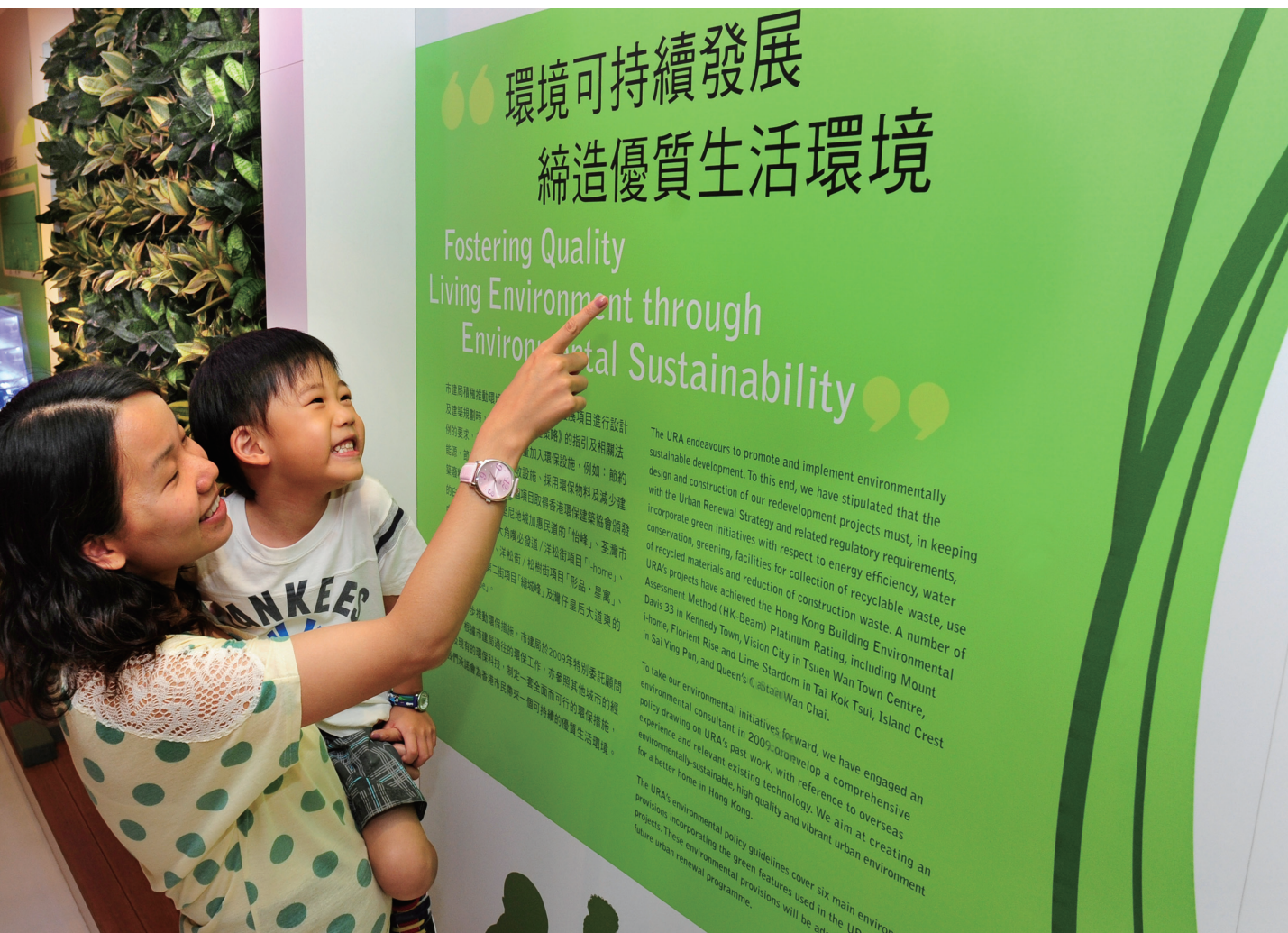
Urban Renewal Exploration Centre displays URA's work in environmental sustainability in its projects.

The URA has played an important role in incorporating environmental sustainability in all aspects of our work in urban renewal. We believe that with proper planning and design, new buildings can achieve much better ventilation and more efficient energy use.