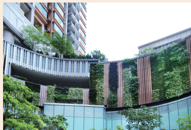
Tsuen Wan Town Centre project