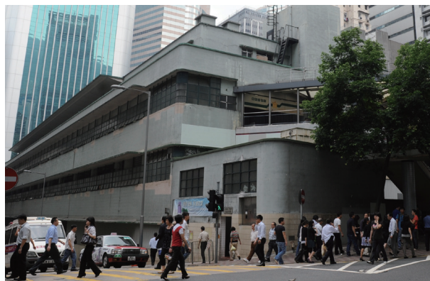
The Central Market building turns into the Central Oasis.