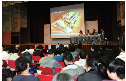
Community engagement process to seek the public's views of the four conceptual designs.