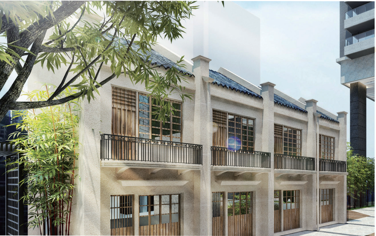
The tenement houses at No.9-12 Yu Lok Lane will be preserved and revitalised.

The URA is firmly committed to preserving and revitalising buildings, sites, and structures that are of historical, cultural or architectural interest, and that are within the scope of the URA's redevelopment projects, or outside its project site, but are supported by the Government. The intention is also to pursue preservation and revitalisation in a comprehensive, holistic and practical manner.