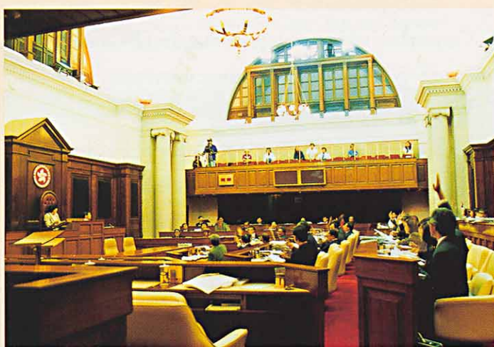
市區重建局條例於二零零零年六月二十七日立法會正式通過。 The Urban Renewal Authority Ordinance was passed in the Legislative Council on 27 June 2000.

二零零零年六月，立法會通過市區重建局條例，為香港市區重建確立了一個積極的全新路向。