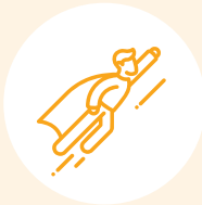
青年發展 Youth development