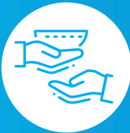
地區共享網絡 Community sharing