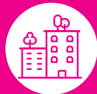
協同周邊活化項目 Synergise with nearby revitalisation initiatives