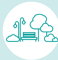
公共空間 Public open space