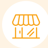
民生小店 Livelihood facilities