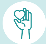
身心健康 Personal wellness