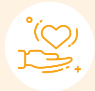
社會功能 Societal function