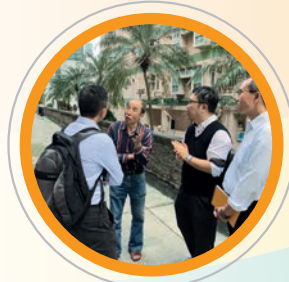
居民訪問 Resident Interviews