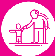
跨代共融 Intergenerational activities