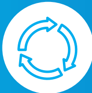
善用資源 Optimal use of resources