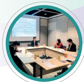
區議員交流 District Council Exchange Sessions