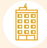
創新共居概念 Co-living innovation