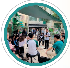
社區活動 Community Outreach Events