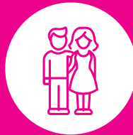
地區文化體驗 Cultural experience