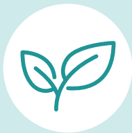
綠化環境 Urban greenery

A stone-throw away from the buzzing Central, local residents yearn for the serene ambience and the presence of a urban oasis in the neighbourhood. Through greening and wellness programmes such as yoga and running, Wellness Common hopes to create a uniquely leisurely environment for city dwellers to relax and recharge.