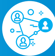
地緣協作 Community collaboration