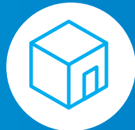
多用途空間 Multifunctional space