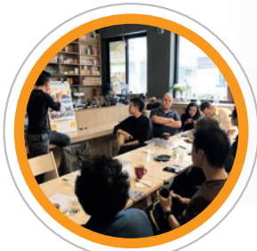
小組討論 Focus Groups