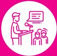
推廣社區教育 Support community education