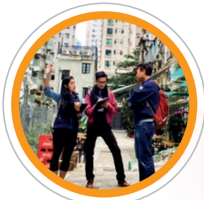
街頭訪問 Street Surveys