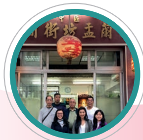
團體訪問 Organisation Interviews