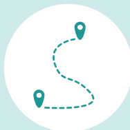
改善步行體驗 Improved walkability